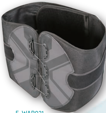
E-WAR021 Q-fit back armour