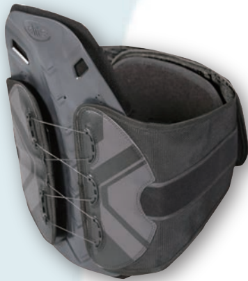
E-WAR021A Premium Q-fit back armour